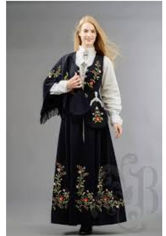
National clothes „Festdrakt“